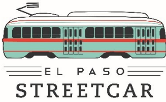
Exhibit A1 Track Access Request - Special Event