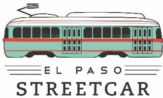
Exhibit A Track Access Request Non-Special Event